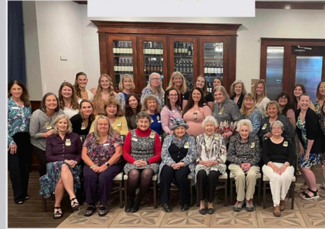
NU NU (DENVER, CO)