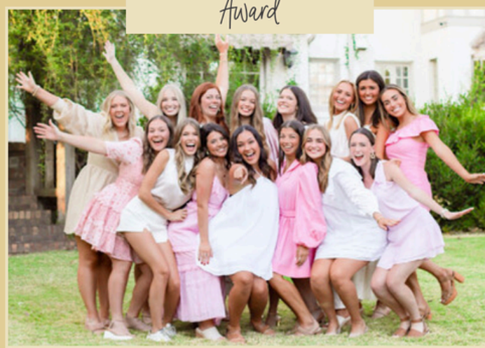
ALPHA UPSILON (THE UNIVERSITY OF ALABAMA)