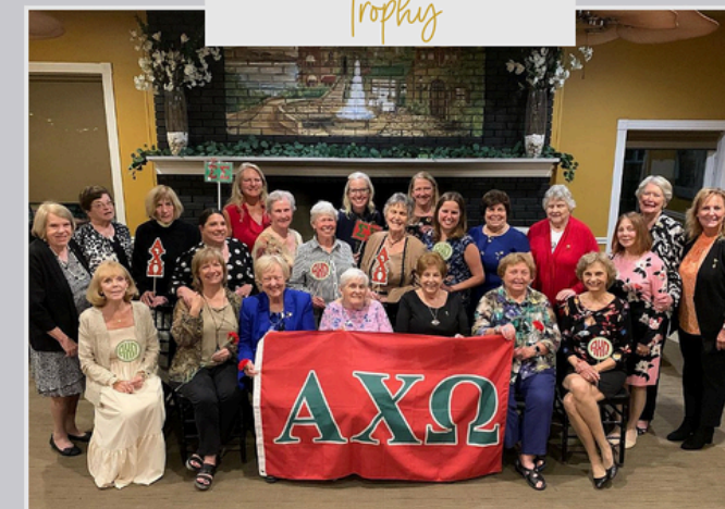
SIGMA SIGMA (ST. LOUIS, MO)

2024 ALUMNAE CHAPTER AWARDS National Council Trophy