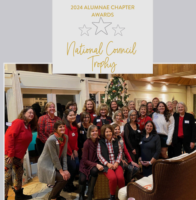
ALPHA GAMMA ALPHA (ATLANTA, GA)

This award is presented to the alumnae chapter that best exemplifies the ideals and mission of Alpha Chi Omega through its accomplishments in all areas of alumnae chapter development. To be considered for the National Council Trophy, the alumnae chapter must complete the National Council Trophy application and submit at least four Seeking the Heights award applications.