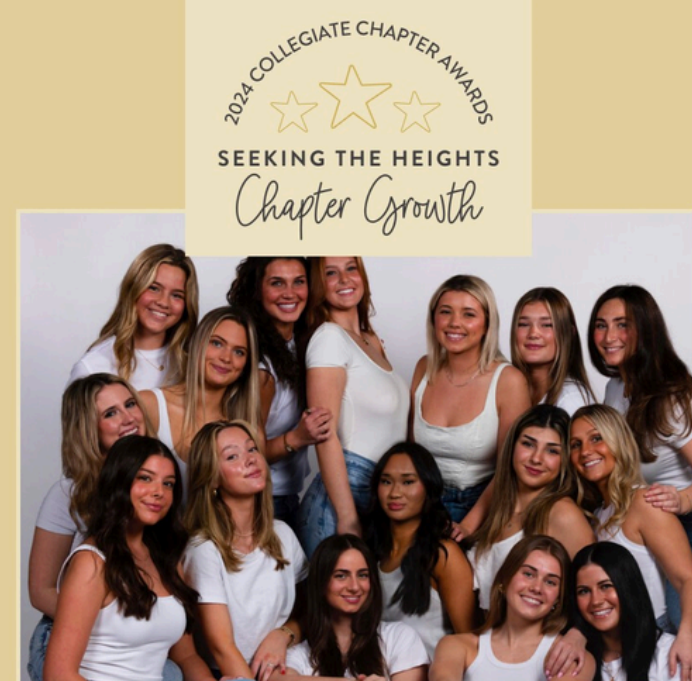
THETA UPSILON (UNIVERSITY OF SOUTH CAROLINA)