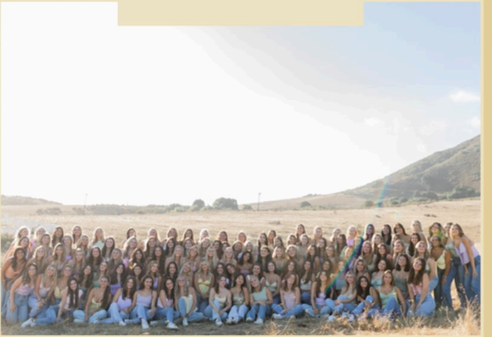
EPSILON OMEGA (CAL POLY, SAN LUIS OBISPO)