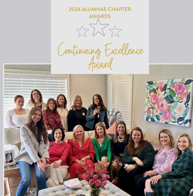
BETA KAPPA BETA (DALLAS, TX)

To be considered for the Continuing Excellence Award, an alumnae chapter must have received the National Council Trophy or Continuing Excellence Award at least once during the last five years and have applied for the National Council Trophy during the current award selection process.