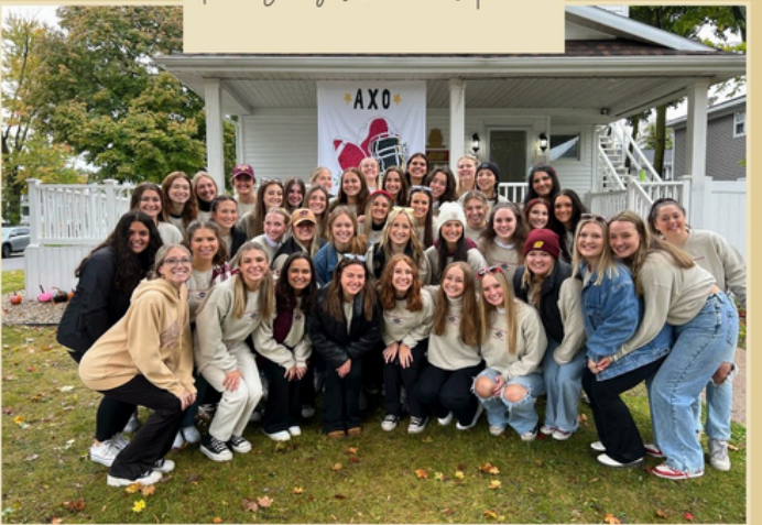
DELTA ZETA (CENTRAL MICHIGAN UNIVERSITY)