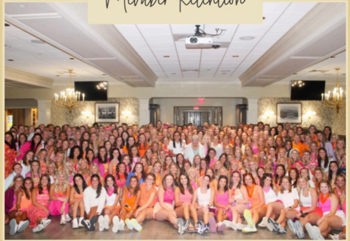
ALPHA UPSILON (THE UNIVERSITY OF ALABAMA)