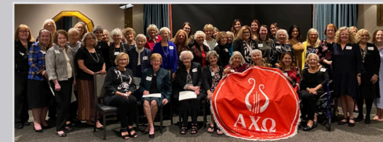
MU MU (KANSAS CITY, MO)