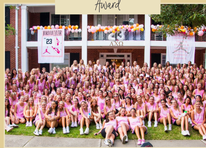
BETA ETA (FLORIDA STATE UNIVERSITY)