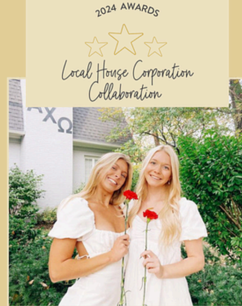
PHI CHAPTER LOCAL HOUSE CORPORATION at the University of Kansas

This award is presented biennially to recognize a Local House Corporation that partners, collaborates and ensures a positive working relationship with the collegiate chapter.