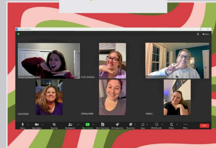
LAMBDA UPSILON LAMBDA (ASHEVILLE, NC)

2024 ALUMNAE CHAPTER AWARDS SEEKING THE HEIGHTS Innovation