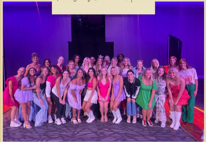
DELTA KAPPA (SAM HOUSTON STATE UNIVERSITY)