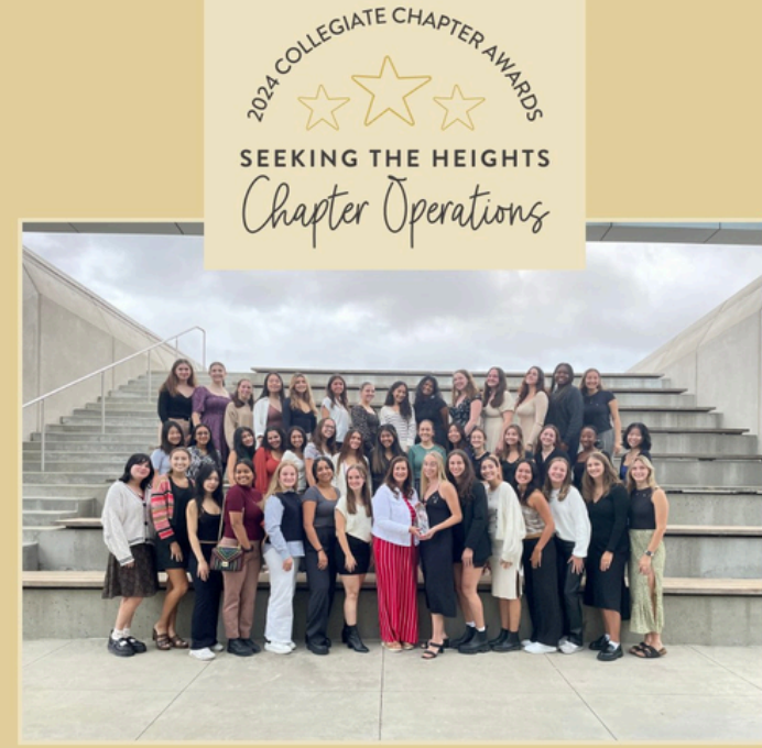
ZETA UPSILON (CASE WESTERN RESERVE UNIVERSITY)