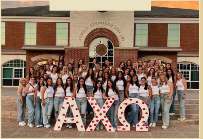
IOTA PHI (QUINNIPIAC UNIVERSITY)