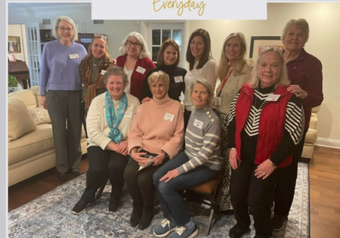
IOTA LAMBDA IOTA (LAKE COUNTY, IL)