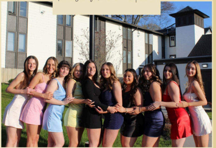
GAMMA SIGMA (UNIVERSITY OF RHODE ISLAND)