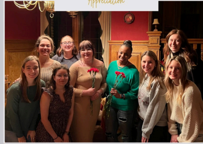
DELTA ETA DELTA (ARLINGTON, TX)