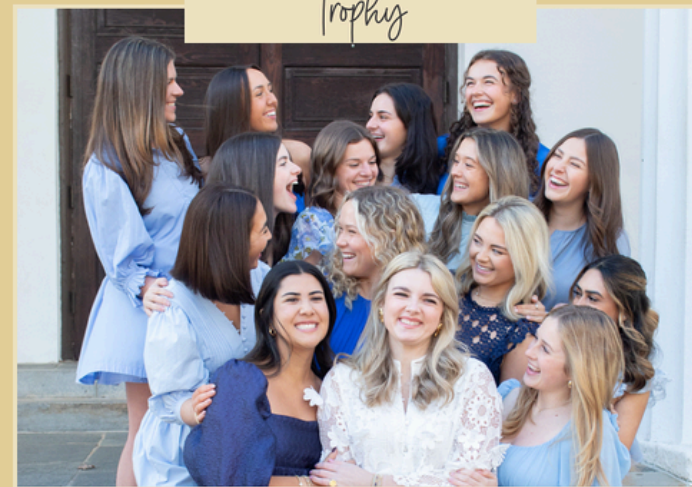
BETA SIGMA (UNIVERSITY OF GEORGIA)