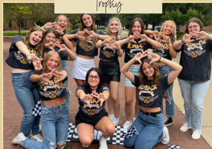
ALPHA ETA (UNIVERSITY OF MOUNT UNION)