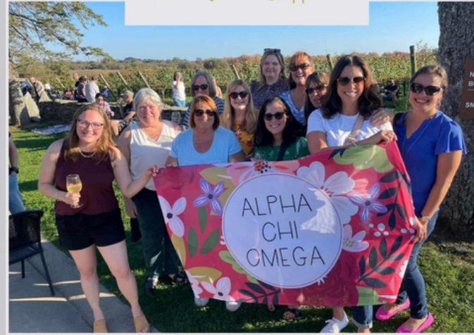
EPSILON PI EPSILON (RHODE ISLAND)

2024 ALUMNAE CHAPTER AWARDS SEEKING THE HEIGHTS Collegiate Support