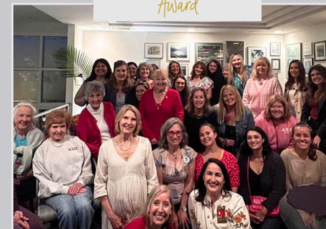
GAMMA THETA GAMMA (LOS ANGELES, CA)

2024 ALUMNAE CHAPTER AWARDS Continuing Excellence Award