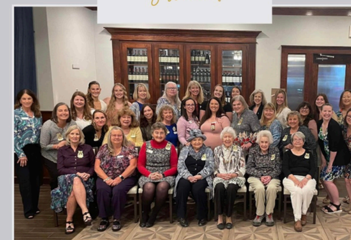
NU NU (DENVER, CO)