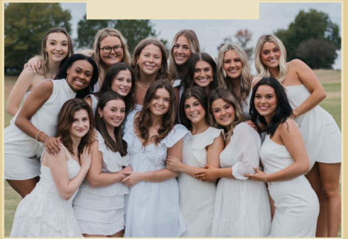
BETA PSI (LOUISIANA TECH UNIVERSITY)