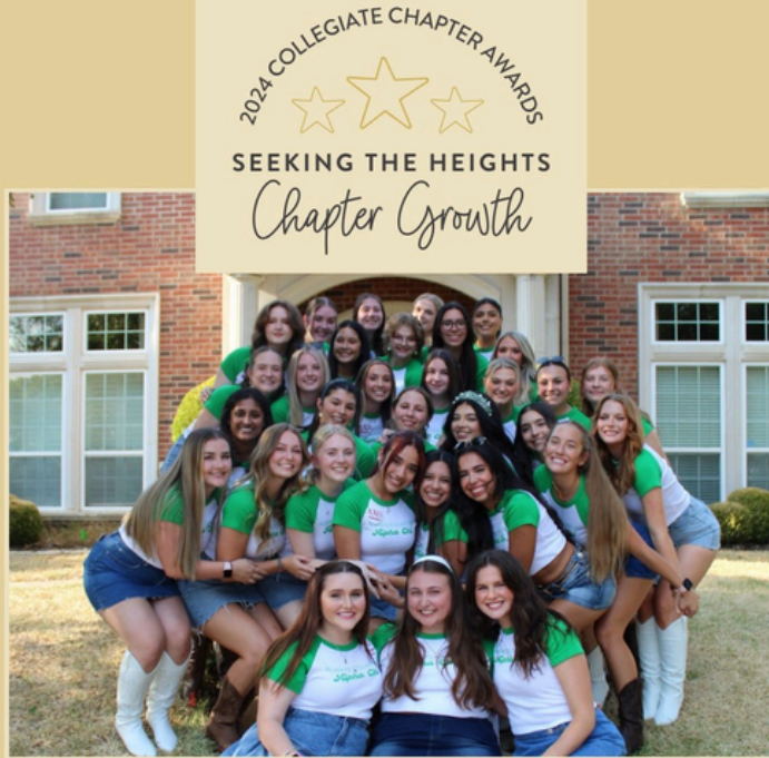
EPSILON LAMBDA (THE UNIVERSITY OF TEXAS AT ARLINGTON)

This award is presented to the chapters that have performed exceptionally in marketing and promoting the sorority experience to potential new members and welcoming new members into Alpha Chi Omega.