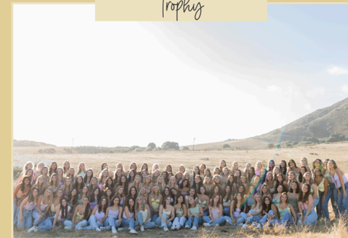
EPSILON OMEGA (CAL POLY, SAN LUIS OBISPO)