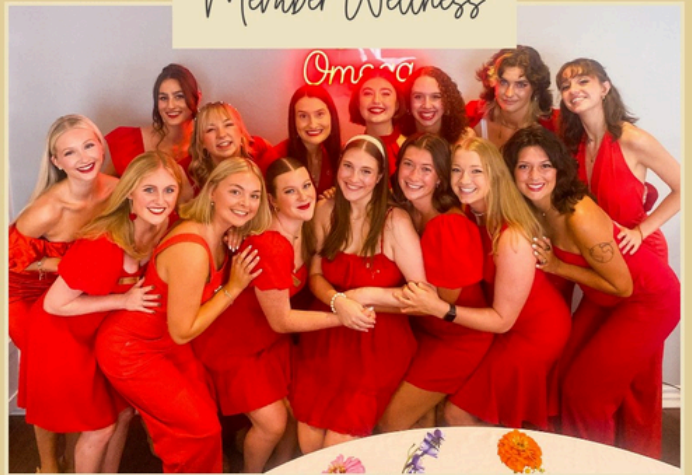
GAMMA TAU (OKLAHOMA CITY UNIVERSITY)