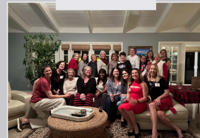
GAMMA TAU GAMMA (NEWPORT BEACH, CA)