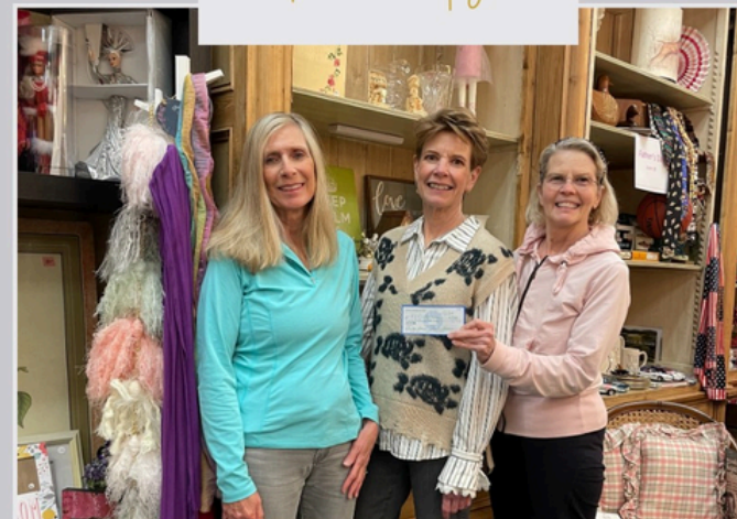
IOTA LAMBDA IOTA (LAKE COUNTY, IL)