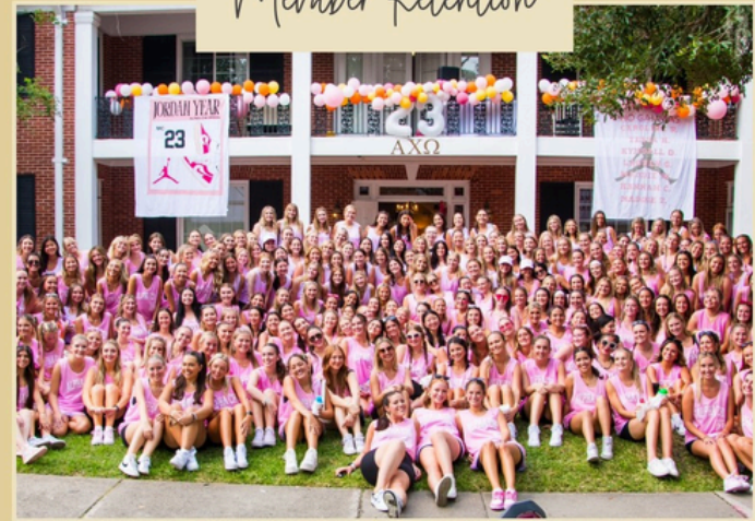
BETA ETA (FLORIDA STATE UNIVERSITY)