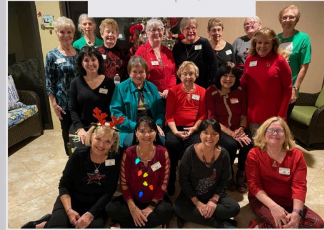
SIGMA CHI SIGMA (THE VILLAGES, FL)