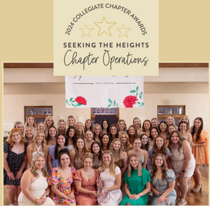
DELTA EPSILON (SOUTHEAST MISSOURI STATE UNIVERSITY)