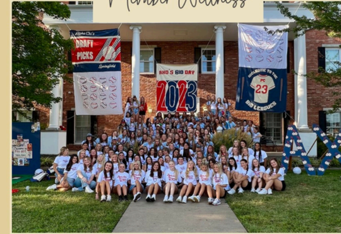
ZETA SIGMA (MISSOURI STATE UNIVERSITY)