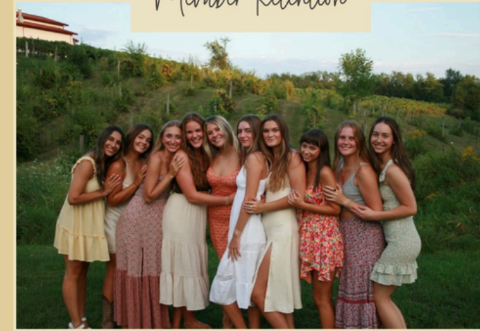
SIGMA (UNIVERSITY OF IOWA)