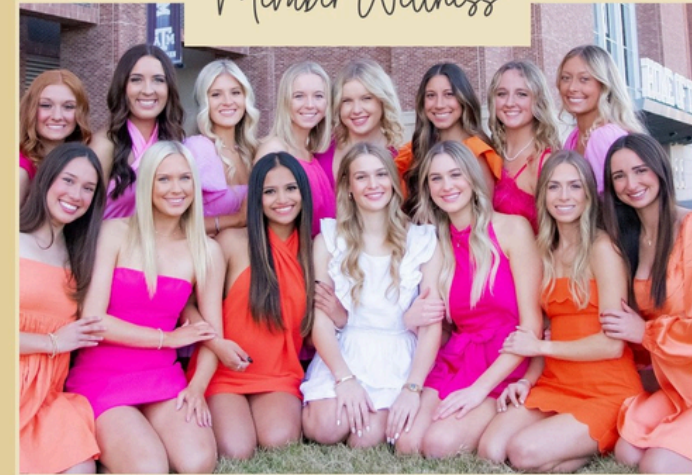
ZETA NU (TEXAS A&M UNIVERSITY)