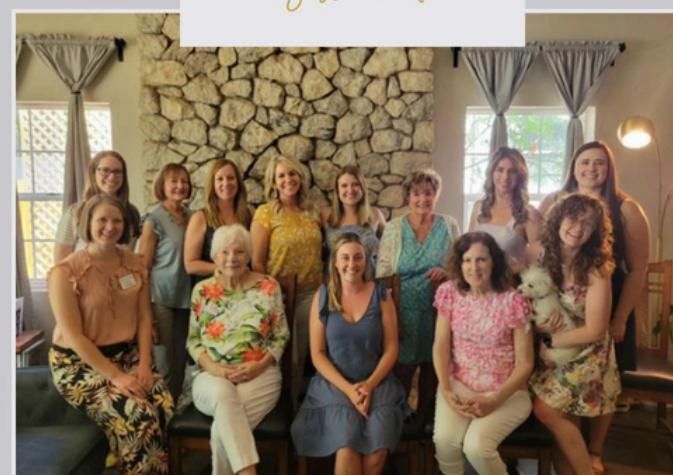
BETA OMEGA BETA (PHOENIX, AZ)