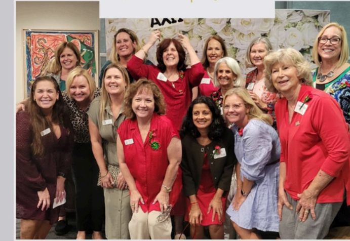
ALPHA ETA ALPHA (JACKSONVILLE, FL)