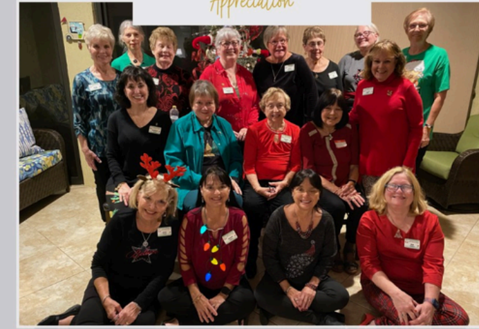
SIGMA CHI SIGMA (THE VILLAGES, FL)