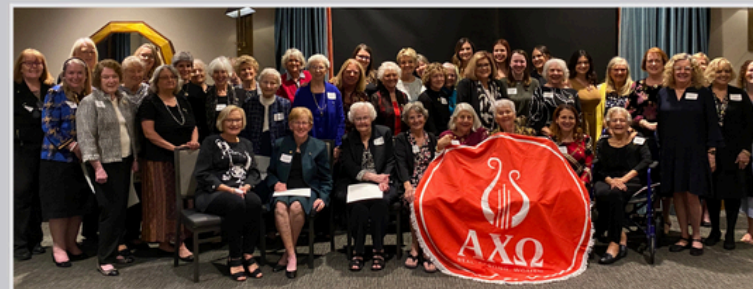
MU MU (KANSAS CITY, MO)

2024 ALUMNAE CHAPTER AWARDS SEEKING THE HEIGHTS Innovation