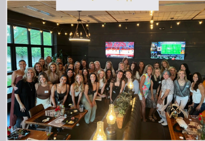
OMICRON PHI OMICRON (ZETA PI ALUMNAE)

2024 ALUMNAE CHAPTER AWARDS SEEKING THE HEIGHTS Collegiate Support