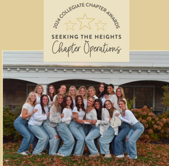
ALPHA MU (INDIANA UNIVERSITY)

This award is presented to the chapters that have exceeded expectations in all areas related to chapter operations and management to ensure that policies and processes of Alpha Chi Omega are being adhered to by chapter leadership and members.