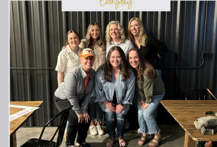
THETA KAPPA THETA (SPRINGFIELD, MO)